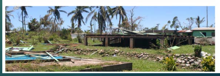
How Fiji is Impacted by Climate Change

Climate change: Ireland failing on 'human rights obligations', says UN